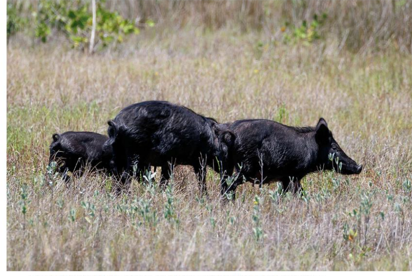
Texas leads the nation in feral hog sightings, according to a recent study released by Captain Experiences.