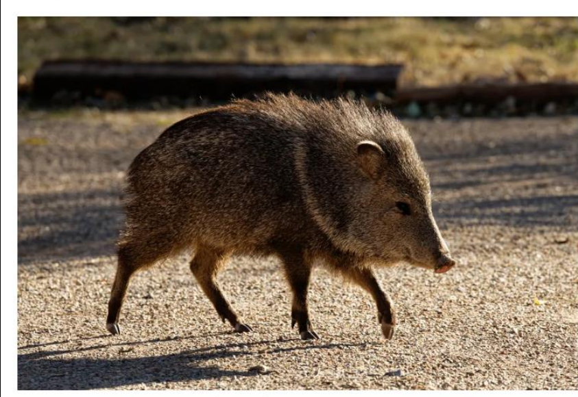
A javelina, also known as a collared peccary.